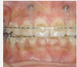
Anterior teeth intrusion

Stable fixation even for major demands in segment treatments.